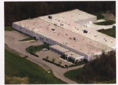
Tri-State Fabricators operates from this 125,000 square-foot facility near Cincinnati.